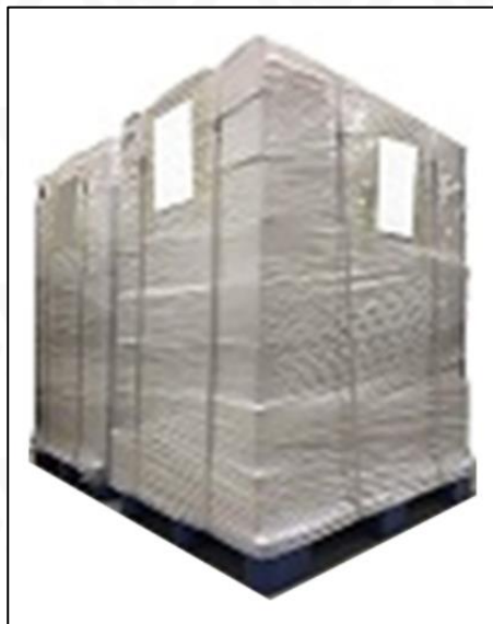
Pic No. 5

International Express Packaging: Wrapped with yellow tape after wrapping black protective film