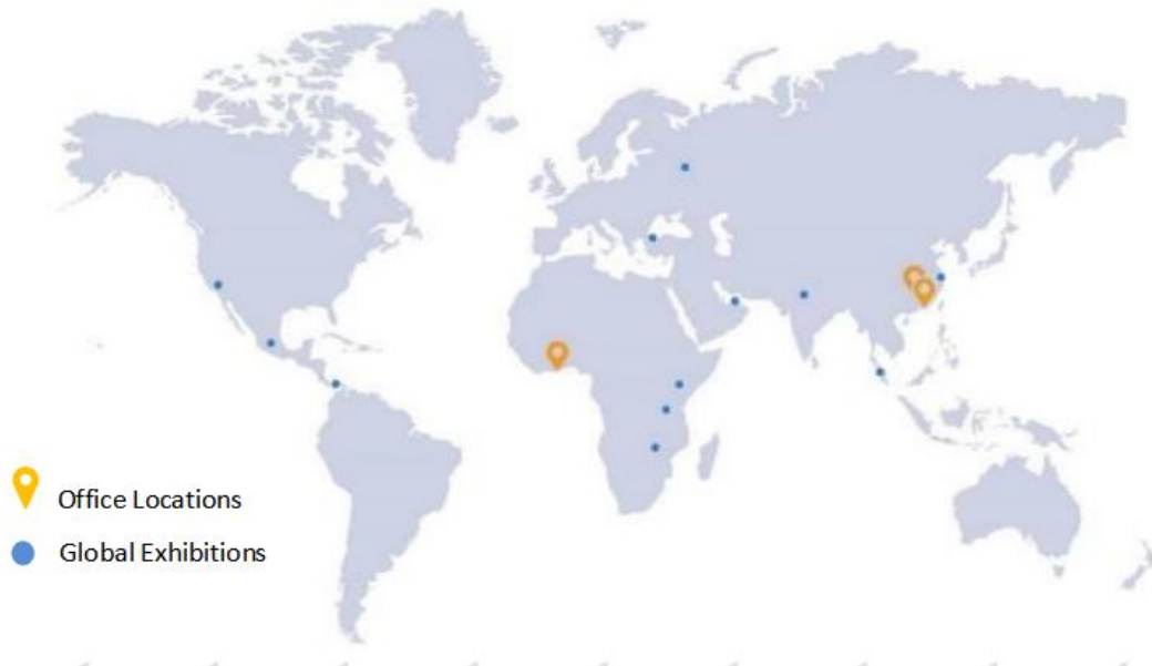
Pic No. 6